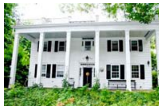
Fell-Thompson-Ackerman House in Allendale, NJ

Nominations are now being accepted for the 2011 list of the 10 Most Endangered Historic Places in New Jersey. 2011 will mark the 17th year that Preservation New Jersey been publicizing the plights of New Jersey's threatened historic resources and the difficult conditions- diminished funds, a lack of effective legislation, neglect, indifference, and more- that keep our state's historic treasures under constant threat. The fates of countless landmarks have been affected when local advocates have used the 10 Most Endangered list to spread the word about a property's plight.